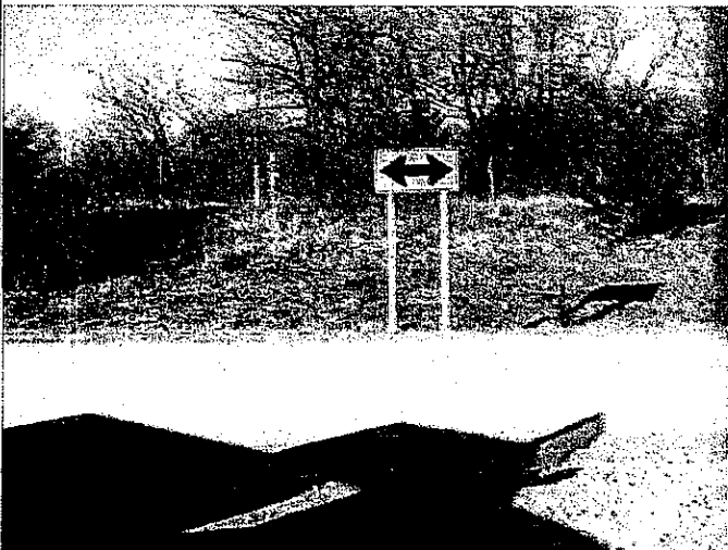
On new frontage road looking North to Woodson Road