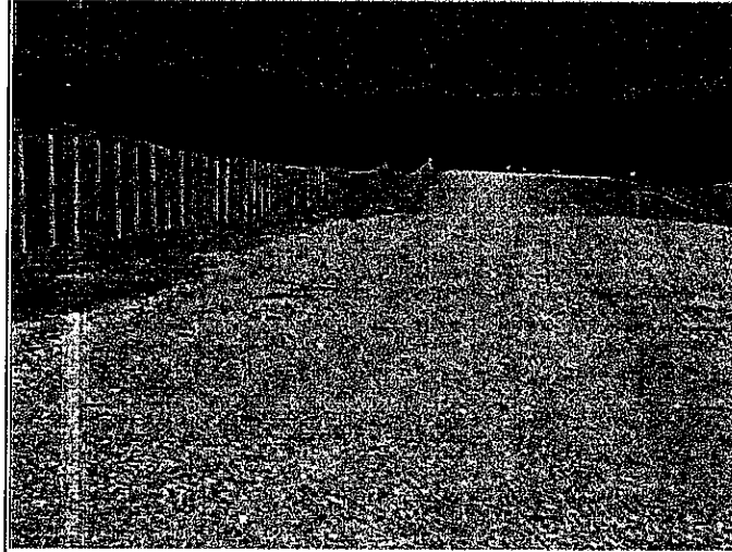
Looking North to Woodson Road on new frontage road

Pictures taken January 20, 2009 by the Franklin County Planning Director.